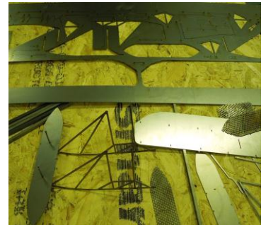
Budde's laser-cut parts

The materials could not be assembled into an integral tunnel model, and even if they had been, the model would have been too frail to survive testing. As an alternative, Walt Hoy persuaded Tom Budde of Budde Sheet Metal Works, Inc. in Dayton to laser-cut the Flyer's parts from a sheet of 16 gage (~.06 inch) sheet metal, much like a model airplane kit. Walt intended to weld the parts together to produce the tunnel model and give it to the student team in time to support testing, but that didn't work out either. The metal was too thin and the parts too small to withstand the heat of welding – the connections just melted away. The only alternative left was to simply give the parts to the