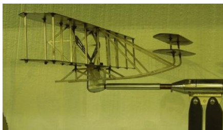
18" solid-wing tunnel model, rudder-off, mounted to measure effects of tail-on wind (airflow left to right)